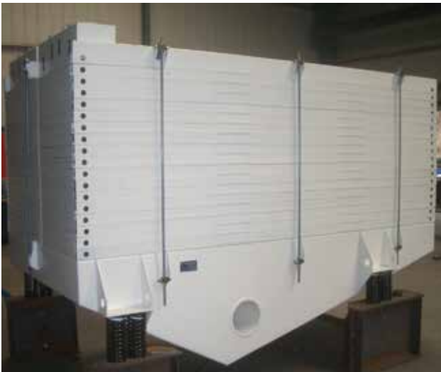
Production machine MHR 20/28/XVII (2 IIX) width 2000 mm, length 2800 mm with 17 decks in two screen units