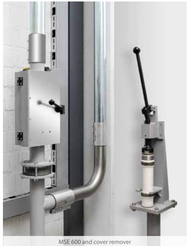
MSE 600 and cover remover