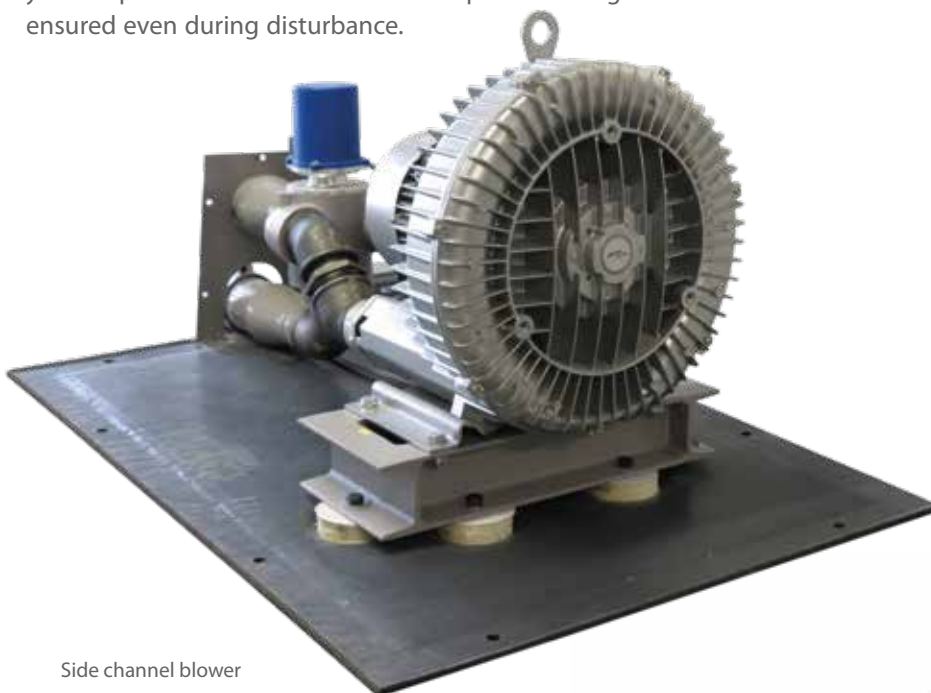
Side channel blower

This means that the documentation is customised to your requirements and that uninterrupted tracking is ensured even during disturbance.