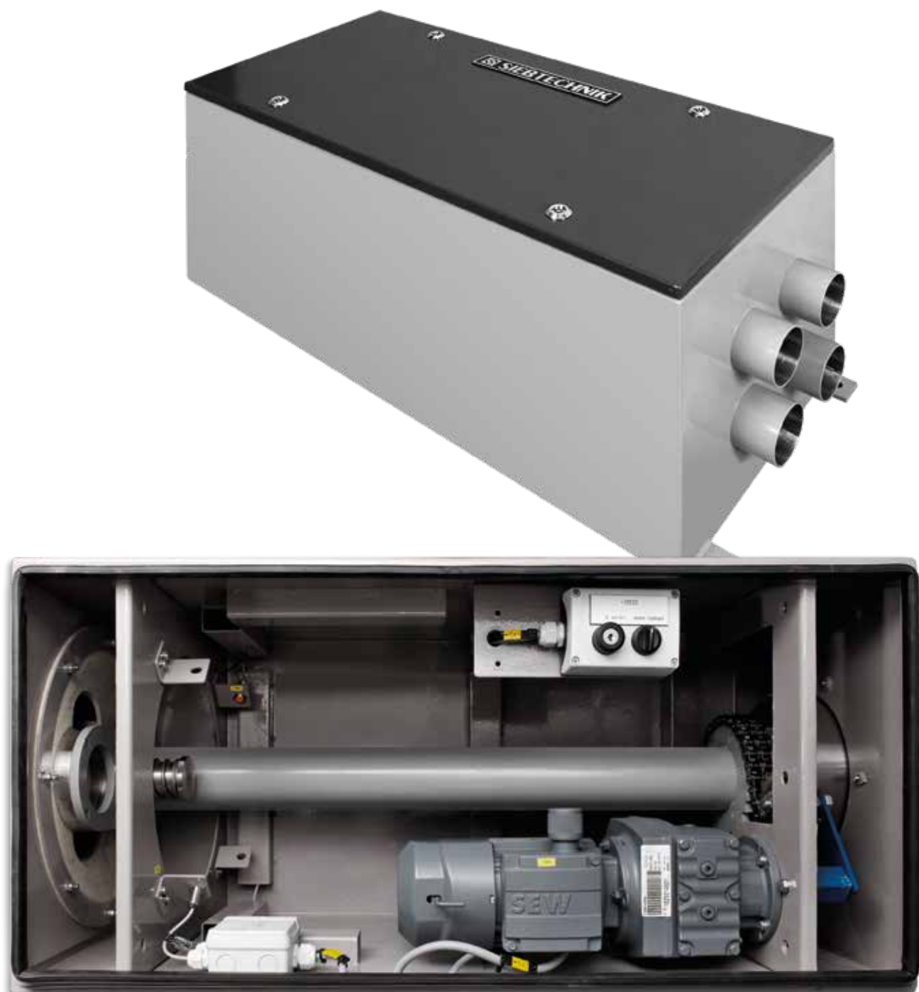
Tube diverter, Type FRW 600